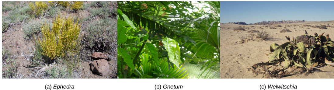
Figure 26.12 (a) Ephedra viridis , known by the common name Mormon tea , grows on the West Coast of the United States and Mexico. (b) Gnetum gnemon grows in Malaysia. (c) The large Welwitschia mirabilis can be found in the Namibian desert. (credit a: modification of work by USDA; credit b: modification of work by Malcolm Manners; credit c: modification of work by Derek Keats)

Mexico. Ephedra 's small, scale-like leaves are the source of the compound ephedrine , which is used in medicine as a potent decongestant. Because ephedrine is similar to amphetamines, both in chemical structure and neurological effects, its use is restricted to prescription drugs. Gnetum species (Figure 26.12b) are found in some parts of Africa, South America, and Southeast Asia, and include trees, shrubs and vines. Welwitschia (Figure 26.12c) is found in the Namib desert, and is possibly the oddest member of the group. It produces only two leaves, which grow continuously throughout the life of the plant (some plants are hundreds of years old). Like the ginkgos, Welwitschia produces male and female gametes on separate plants.