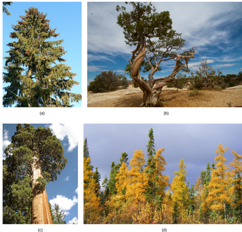
Figure 26.9 Conifers. Conifers are the dominant form of vegetation in cold or arid environments and at high altitudes. Shown here are the (a) evergreen spruce Picea sp., (b) juniper Juniperus sp., (c) coastal redwood or sequoia Sequoia sempervirens , and (d) the tamarack Larix laricina . Notice the deciduous yellow leaves of the tamarack. (credit a: modification of work by Rosendahl; credit b: modification of work by Alan Levine; credit c: modification of work by Wendy McCormic; credit d: modification of work by Micky Zlimen)

Conifers are the dominant phylum of gymnosperms, with the greatest variety of species (Figure 26.9). Typical conifers are tall trees that bear scale-like or needle-like leaves. Water evaporation from leaves is reduced by their narrow shape and a thick cuticle. Snow easily slides off needle-shaped leaves, keeping the snow load light, thus reducing broken branches. Such adaptations to cold and dry weather explain the predominance of conifers at high altitudes and in cold climates. Conifers include familiar evergreen trees such as pines, spruces, firs, cedars, sequoias, and yews. A few species are deciduous and lose their leaves in fall. The bald cypress, dawn redwood, European larch and the tamarack (Figure 26.9c) are examples of deciduous conifers. Many coniferous trees are harvested for paper pulp and timber. The wood of conifers is more primitive than the wood of angiosperms; it contains tracheids , but no vessel elements, and is therefore referred to as “soft wood.”