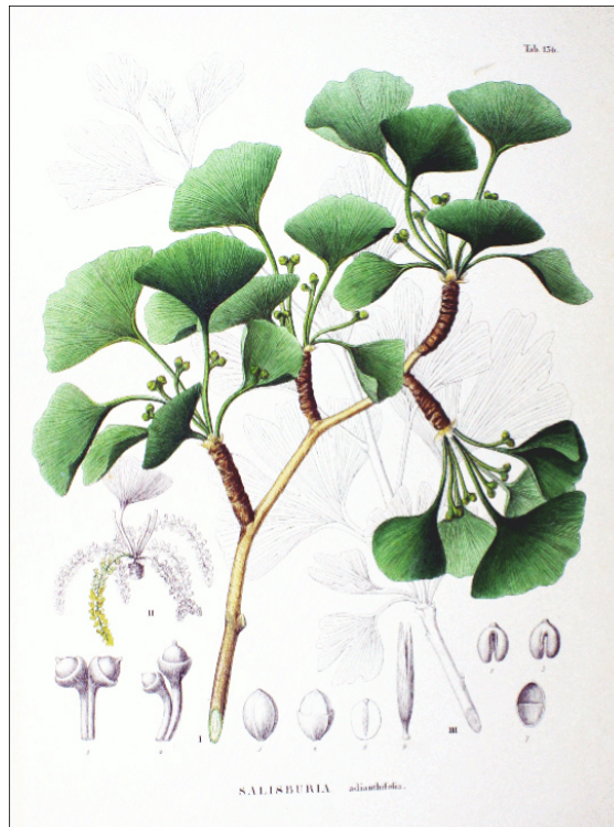
Figure 26.11 Ginkgo . This plate from the 1870 book Flora Japonica, Sectio Prima (Tafelband) depicts the leaves and fruit of Ginkgo biloba , as drawn by Philipp Franz von Siebold and Joseph Gerhard Zuccarini.

The single surviving species of the ginkgophytes group is Ginkgo biloba (Figure 26.11). Its fan-shaped leaves—unique among seed plants because they feature a dichotomous venation pattern—turn yellow in autumn and fall from the tree. For centuries, G. biloba was cultivated by Chinese Buddhist monks in monasteries, which ensured its preservation. It is planted in public spaces because it is unusually resistant to pollution. Male and female organs are produced on separate plants. Typically, gardeners plant only male trees because the seeds produced by the female plant have an off-putting smell of rancid butter.