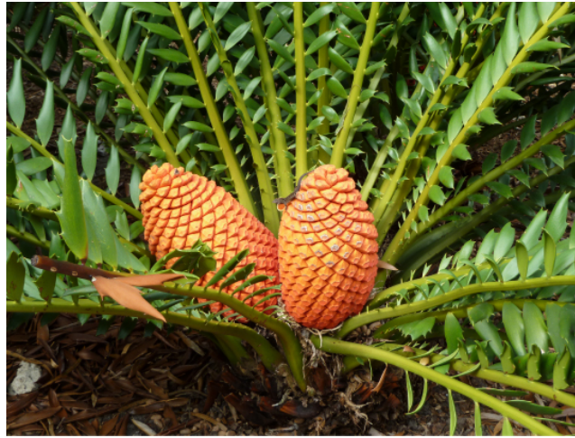
Figure 26.10 Cycad. This cycad, Encephalartos ferox , has large cones and broad, fern-like leaves.