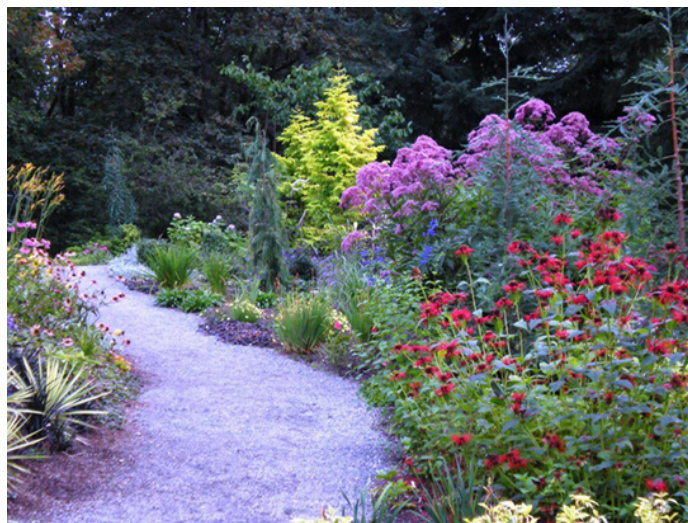
Figure 26.13 Flowers. These flowers grow in a botanical garden border in Bellevue, WA. Flowering plants dominate terrestrial landscapes. The vivid colors of flowers and enticing fragrance of flowers are adaptations to pollination by animals like insects, birds, and bats. (credit:

From their humble and still obscure beginning during the early Jurassic period, the angiosperms—or flowering plants—have evolved to dominate most terrestrial ecosystems (Figure 26.13). With more than 300,000 species, the angiosperm phylum (Anthophyta) is second only to insects in terms of diversification.